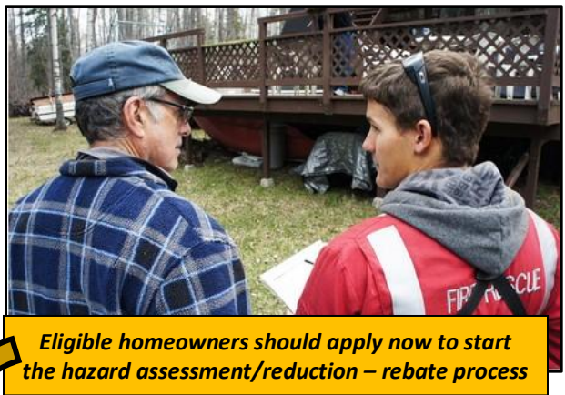
Eligible homeowners should apply now to start the hazard assessment/reduction – rebate process

Who? - Property owners in any of Rosland’s FireSmart Communities Program ‘recognized’ neighbourhoods – can apply. Currently, there are seven recognized neighbourhoods in Rosland: Black Bear, McLeod East, Iron Colt, Kirkup McLeod, Earl Davis, Upper West Spokane and Red Mtn. Black Bear neighbourhood is shown in the sample map at left. Neighbourhood maps can be viewed at www.rossland.ca/rossland-firesmart-program