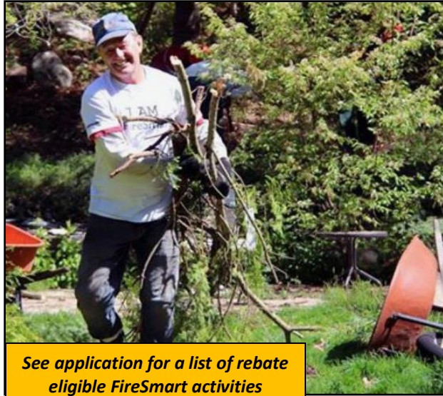
See application for a list of rebate eligible FireSmart activities

What? - Rosland’s ‘FireSmart Rebate Program’ is offering some property owners a rebate of up to $500 for qualified FireSmart hazard reduction work performed on their homes and yards. Homeowners will be reimbursed for 50% of material and labor costs with a maximum $500 rebate per property on a $1,000 or more expenditure.