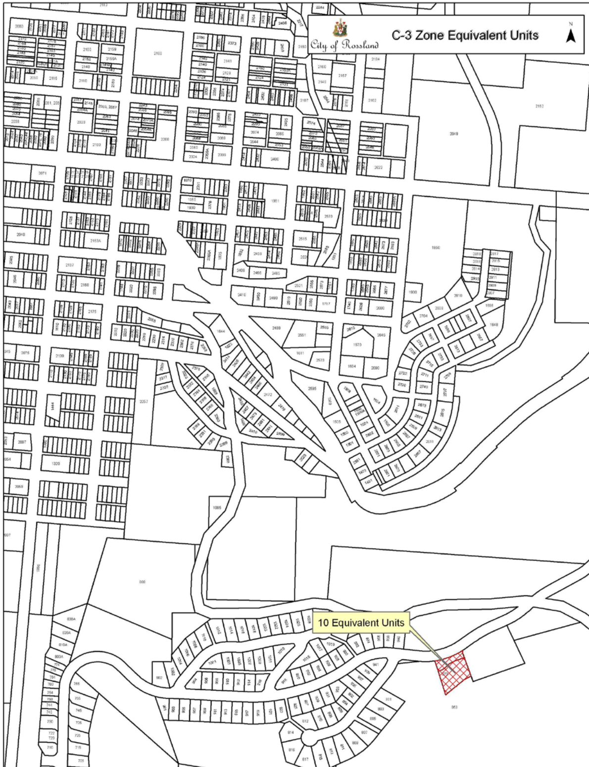
Diagram 7.3 – C-3 Zone Equivalent Units