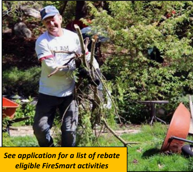
See application for a list of rebate eligible FireSmart activities

What? - Rosland’s ‘FireSmart Rebate Program’ is offering some property owners a rebate of up to $500 for qualified FireSmart hazard reduction work performed on their homes and yards. Homeowners will be reimbursed for 50% of material and labor costs with a maximum $500 rebate per property on a $1,000 or more expenditure.