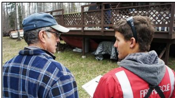
Eligible homeowners should apply now to start the hazard assessment/reduction – rebate process

Who? - Property owners in any of Rosland’s FireSmart Neighbourhood Program ‘recognized’ neighbourhoods – can apply. Currently, there are seven recognized neighbourhoods in Rosland: Black Bear, McLeod East, Iron Colt, Kirkup McLeod, Earl Davis, Upper West Spokane and Red Mtn. Black Bear neighbourhood is shown in the sample map at left. Neighbourhood maps can be viewed at http://www.rossland.ca/firesmart-program